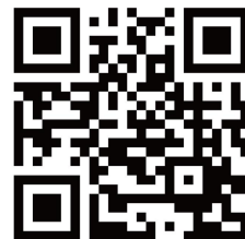
Official QR code

all has its domestic sales amount coming out at the top and some products have ready sale in Southeast Asia. Its products can be found in all